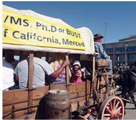
Signifying the pioneering spirit of UC Merced’s founding faculty, staff, and students, a covered wagon led the procession into UC Merced’s Grand Opening Convocation.

The opening of UC Merced will help fulfill the University of California promise of access to qualified students, eventually offering enrollment to 25,000 students by the year 2030. Symbolizing the pioneering spirit of the first class, three students – a first-year student, a transfer student from Merced College and a graduate student – rode into the